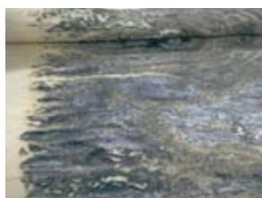
Fig 3: Severe microbiological fouling

During off-line periods biofouling can occur throughout the entire plant if shutdown procedures are not followed correctly. Consequently on start up problems of reduced flux, increased dP and salt passage may occur across the entire system.