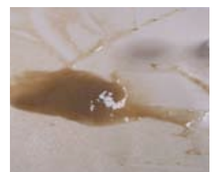
Fig 4: Biofilm sampling prior to membrane autopsy & identification

It is recognised that chlorine oxidizes and breaks down natural organic matter (NOM) present in the feed water to more easily biodegradable by-products providing a nutrient source to micro-organisms. In