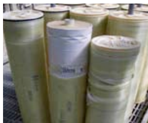
Fig 2: Pressure related compaction

Biofouling in RO systems can be defined as the growth of biomass on the membrane surface which is sufficient to cause operational problems. The effects of biofouling will show as an increase in differential pressure (dP), with a consequent reduction in flux, and increase in pumping and electrical costs. Severe biofouling may result in membrane degradation and physical damage. During operation the increase in dP is usually observed in the lead elements of the system, closest to the source of contamination, however telescoping and compaction may occur in the rear elements.